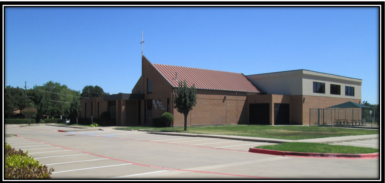
1990 – 2005 802 W. Bellaire Blvd. Lewisville, Texas 75067 (972) 221-5668