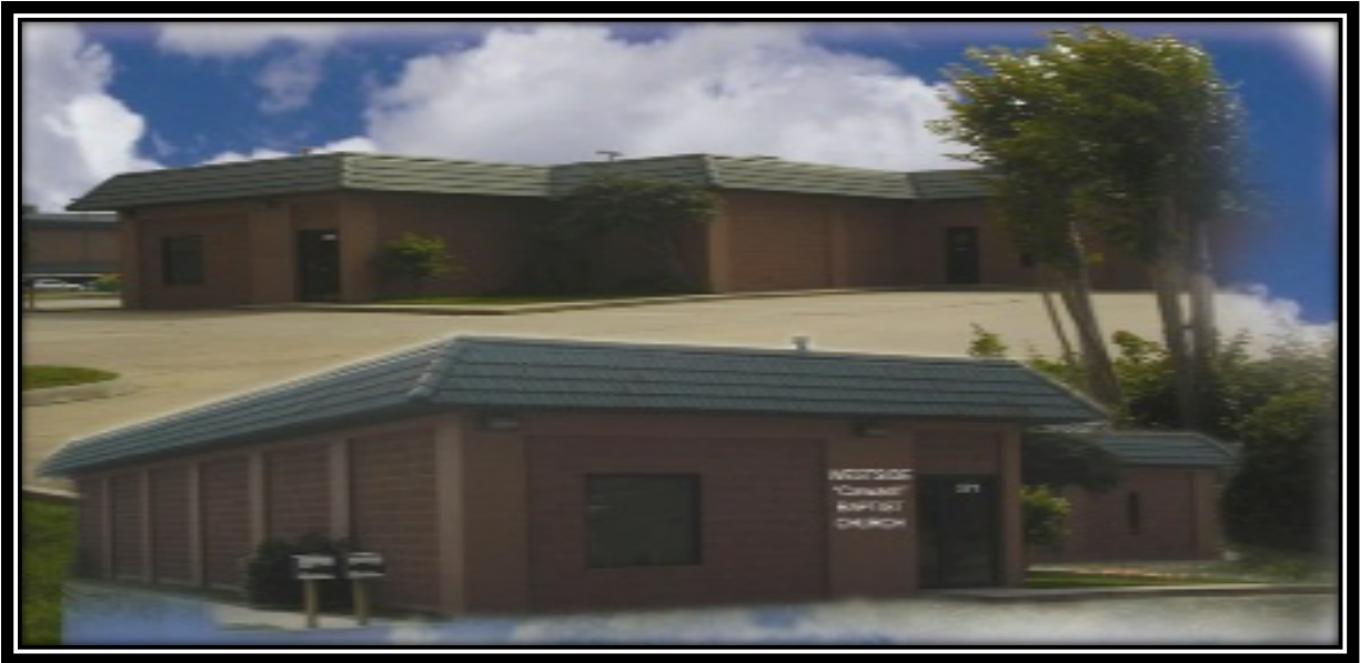
1984 – 1990 Westside (Car Wash) Baptist Church 571 South Edmonds Lewisville, Texas 75067 (972) 221-5668