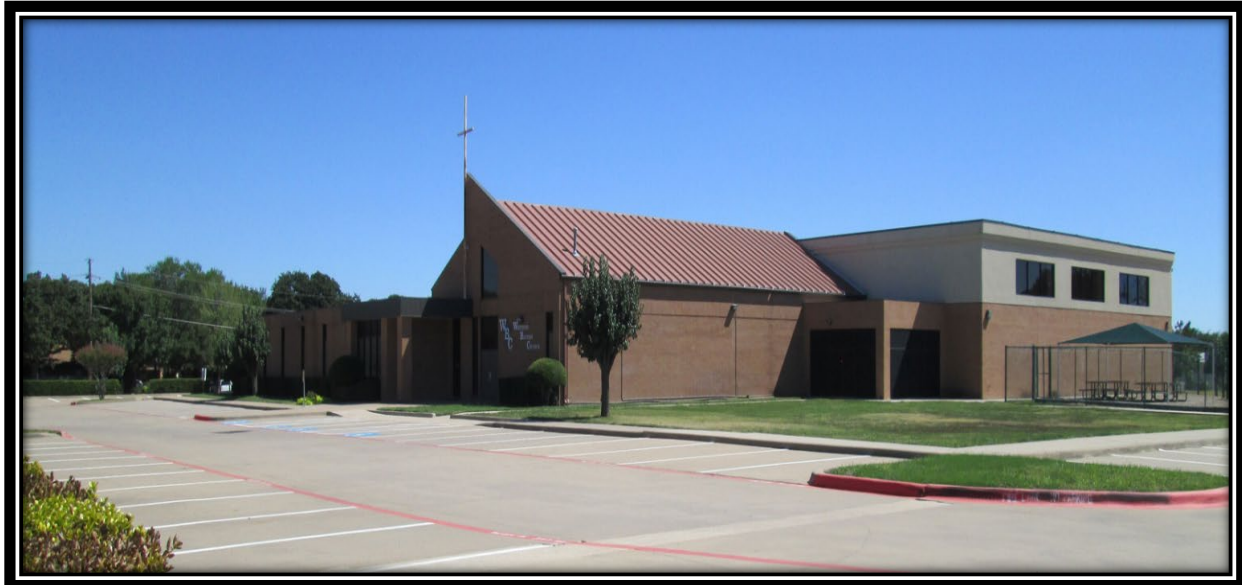
1990 – 2005 802 W. Bellaire Blvd. Lewisville, Texas 75067 (972) 221-5668