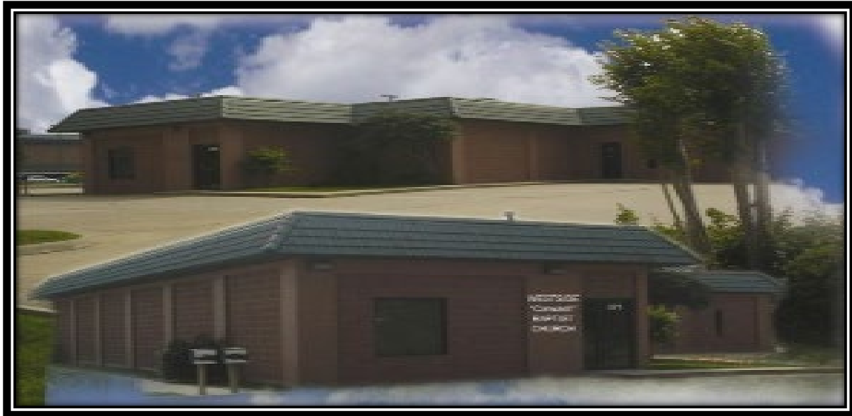
1984 – 1990 Westside (Car Wash) Baptist Church 571 South Edmonds Lewisville, Texas 75067 (972) 221-5668